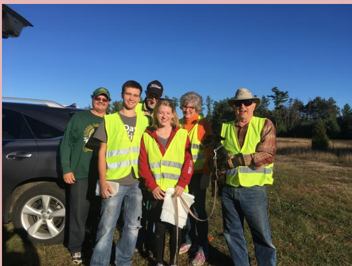
Part of the Highway Cleanup Crew