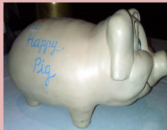
Attendance: 30 Happy Pig: About $28 was donated to the pig.