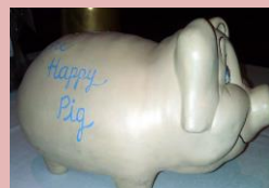
Attendance: 24 Happy Pig: About $19 was donated to the pig.