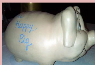
Attendance: 27 Happy Pig: About $21 was donated to the pig.