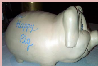
Attendance: 22 Happy Pig: About $8 was donated to the pig.