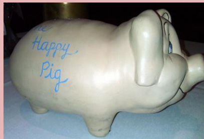
Attendance: 25 Happy Pig: About $14 was donated to the pig.