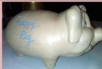
Attendance: 25 Happy Pig: About $25 was donated to the pig.