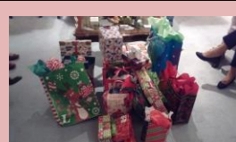
White Elephant Gift Pile