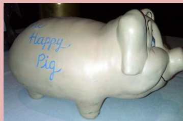
Attendance: 28 Happy Pig: About $37 was donated to the pig.