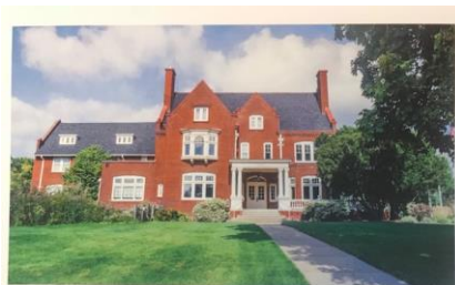
Wisconsin River Papermaking Museum 730 First Avenue South, Wisconsin Rapids, WI 54495

Program: Wisconsin River Papermaking Museum